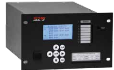
IRS - model