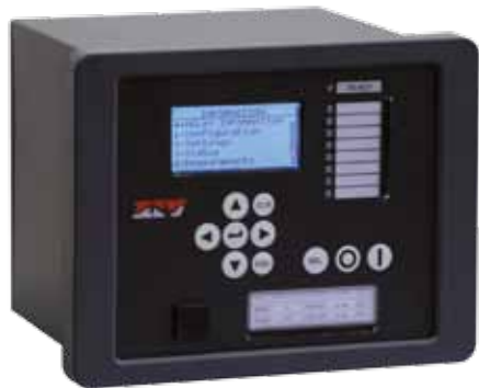
IRL - model

Multifunction Protections for MV Power Systems & Industry